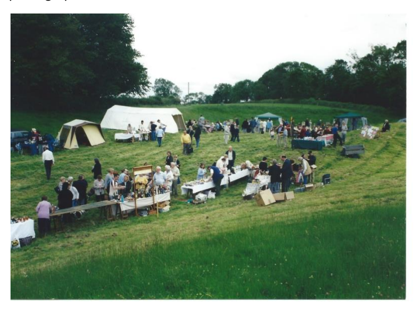
A general view of the 2002 Fete

Below are some photographs to illustrate some of the events mentioned in the minutes.