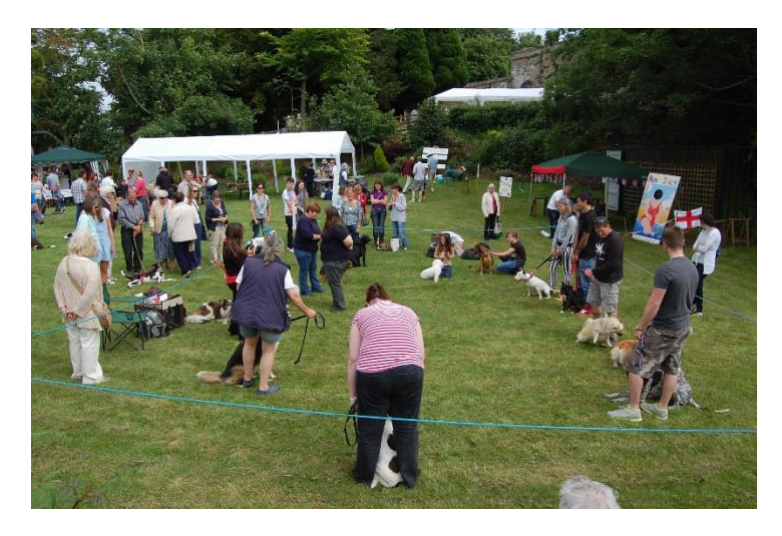
2013 was one of the years when a dog show was among the attractions.