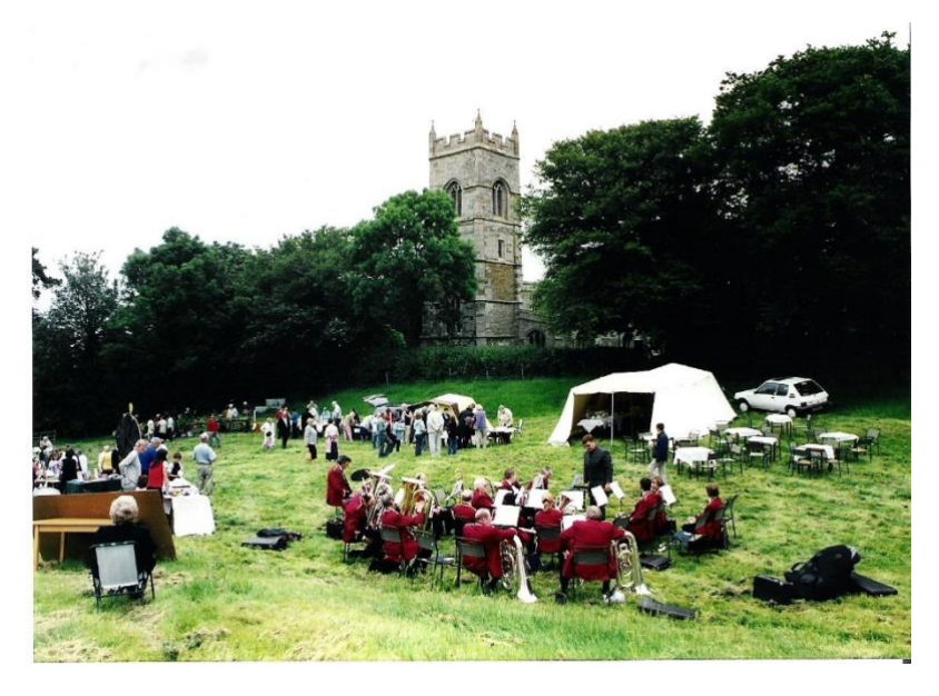
The Corby Silver Band were frequently part of the celebrations. This was in 2002.