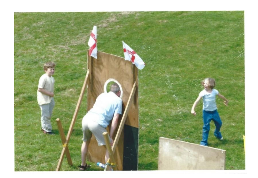
The 'Aunt Sally' needed a brave volunteer to be the victim. This action shot is from 2006. Below is the programme of the Flower Festival of 1993, with its theme of the four seasons.